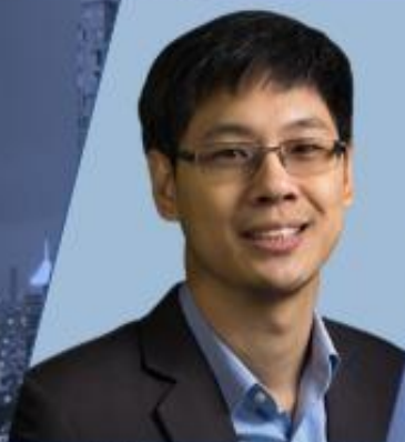
Sec. KARL KENDRICK T. CHUA National Economic and Development Authority (NEDA)