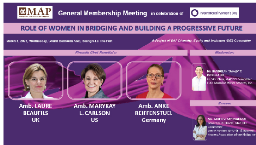
March 8, 2023 MAP General Membership Meeting (GMM) on International Women's Day