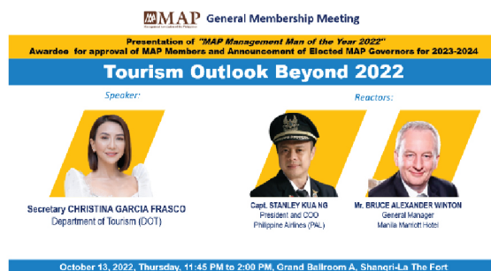
October 13, 2022 MAP GMM