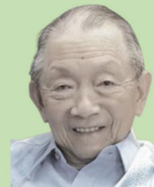
WASHINGTON Z. SYCIP+ MMY 1967 MAP Co-Founder