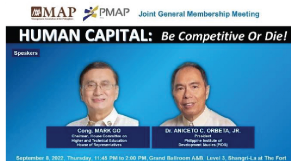
September 8, 2022 MAP - PMAP Joint GMM