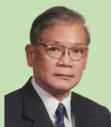
JAIME C. LAYA MAP President 1973