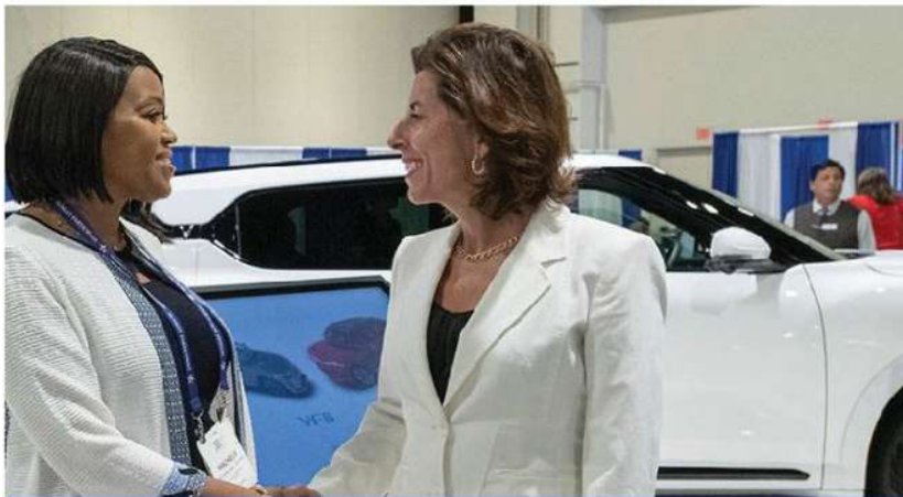
Secretary Gina M. Raimondo at 2022 SUSA Investment Summit

"It is THE event to attend for anyone considering expansion in the USA."