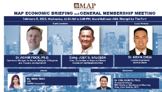
February 8, 2023 MAP Economic Briefing and General Membership Meeting (GMM)