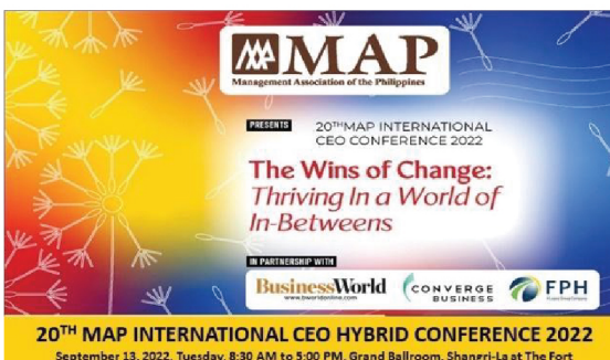
September 13, 2022 MAP International CEO Hybrid Conference