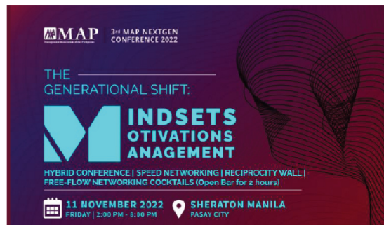
November 11, 2022 3rd MAP NextGen Conference 2022