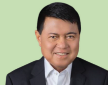
MANUEL B. VILLAR JR.