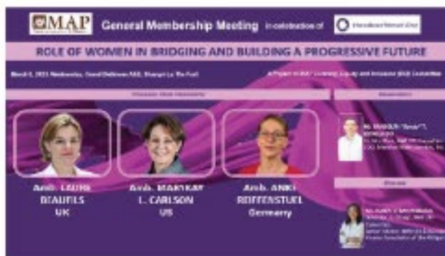
March 8, 2023 MAP General Membership Meeting (GMM) on International Women's Day