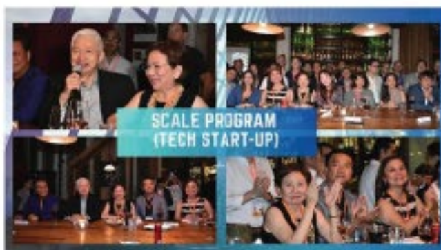
MAP Activities (loop)