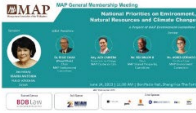
MAP GMM on "National Priorities on Environment, Natural Resources and Climate Change"