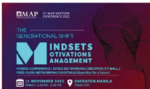
November 11, 2022 3rd MAP NextGen Conference 2022