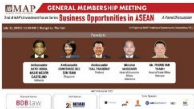
July 12, 2023 MAP GMM on Business Opportunities in ASEAN