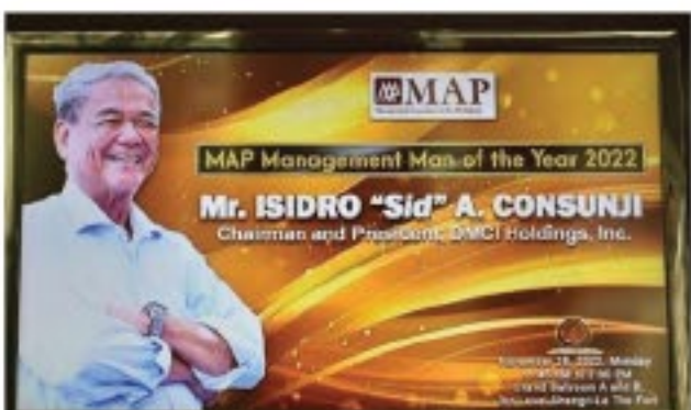
November 22, 2022 MAP Annual General Membership Meeting and "MAP Management Man of the Year 2022" Awarding Ceremony