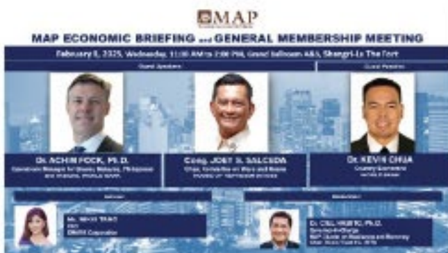
February 8, 2023 MAP Economic Briefing and General Membership Meeting (GMM)